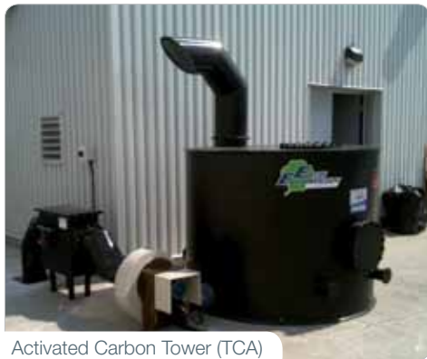
Activated Carbon Tower (TCA)