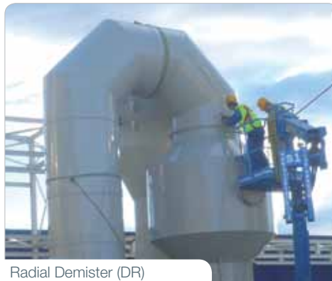
Radial Demister (DR)