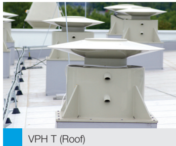
VPH T (Roof)