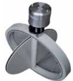
Damper (waterproof, motorized)