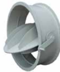
Damper Ø 500 to 2 000 mm