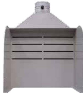
Fume Exhaust Hood