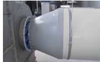
Flanges & Fittings