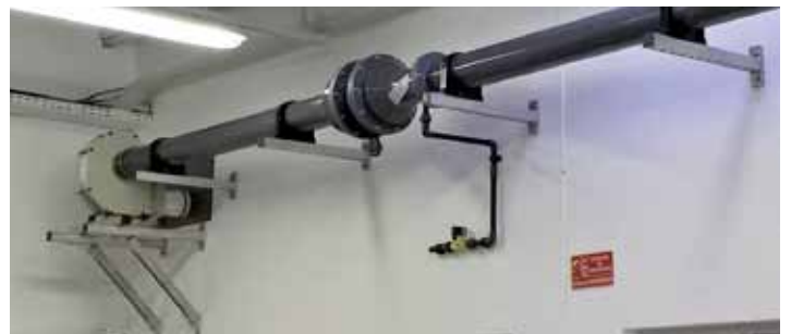
VARIOUS INDUSTRIES: TANNERIES, ETC.

Industrial processes generate various pollutants: our job is to optimise ventilation , in line with your requirements and those of the regulations in force.