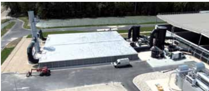
TREATMENT OF WASTE & COMPOSTING