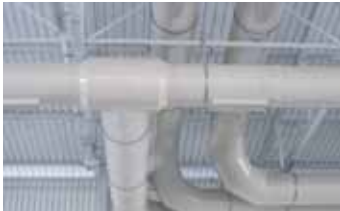
Pipes & Elbows