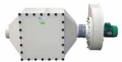
Activated carbon case