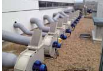
Laboratory centrifugal fan