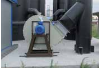
Medium / High pressure centrifugal fan