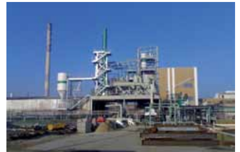
LIGHT & HEAVY CHEMISTRY